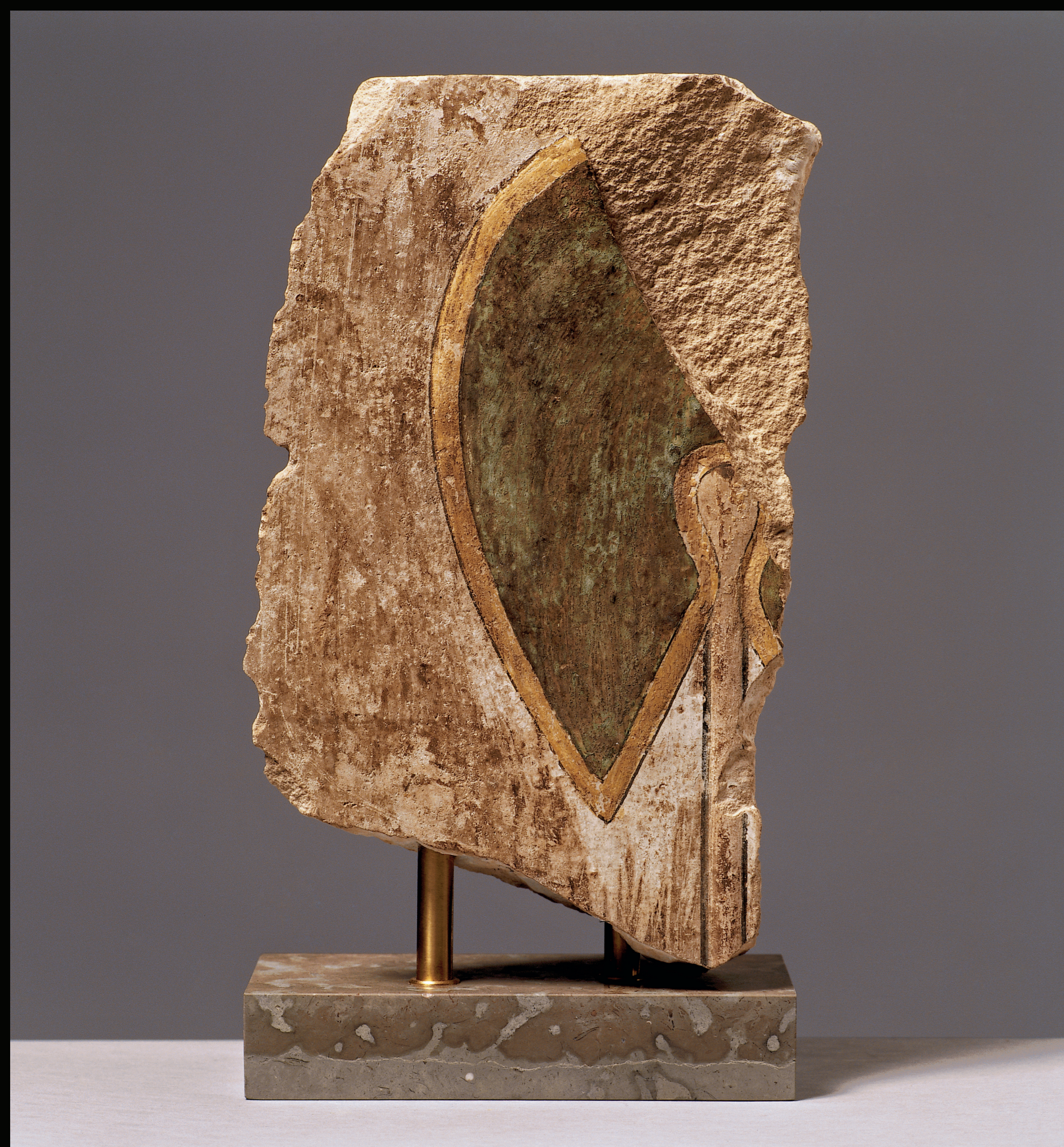
Fig. 1 Sampled fragment from the Palace of Apries (inv. no. JEIN 1060), Memphis, Egypt, 26 th Dynasty, 589–568 BCE, H 24.3 cm, W 14.6 cm, D 8.2 cm.

Proteomics, ancient polychromy, paint binders, collagen, ancient art